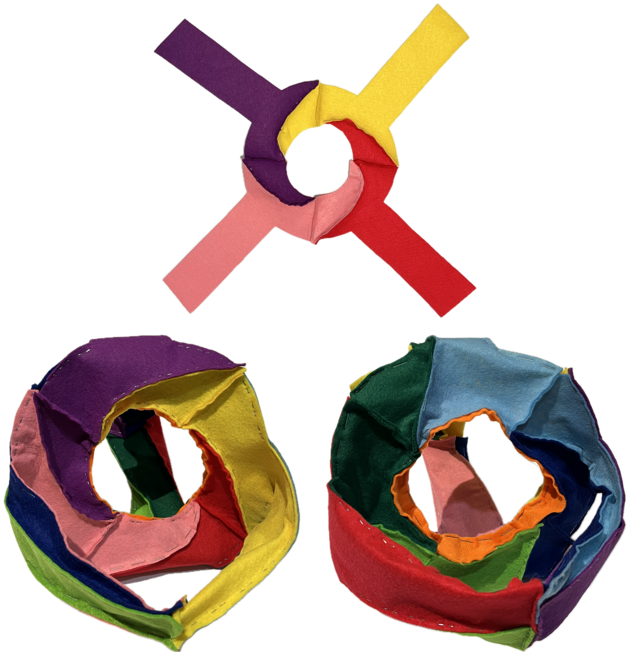
Figure 1: The A pieces of a 9-color genus-3 map that conforms exactly to Heffter’s table (top) and the two sides of the complete Heffter map (bottom). The B/C side of this map (bottom right) is identical to the map in the paper.

Randolph-Macon College, Ashland, Virginia, USA; etorrenc@rmc.edu