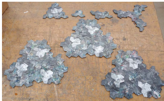
Figure 4: Metatiles are used to generate supertiles (which can be used to make larger supertiles) before thinset is spread.

When tiling, an adhesive substrate (typically a thinset or mastic) bonds tiles to the tiling surface. These substrates have a limited working time. Tiles must be placed within this working time or tile adhesion will be weak and prone to damage [1]. When working with periodic tilings, the location and orientation of a tile can generally be quickly deduced by observing the immediately adjacent tiles. However, with aperiodic tiles, arranging individual tiles is non-intuitive. It is generally not possible to correctly arrange a new tile solely by observing a few adjacent tiles. A single incorrectly oriented tile may appear at first to fit the aperiodic (but not random!) pattern, but it will soon result in a dead-end. Adjusting these incorrectly placed tiles wastes precious working time with your adhesive medium. It is therefore critical to have a method in place for efficiently and correctly placing hat tiles on your surface. The advice for efficiently and correctly placing hat monotiles can be reduced to two suggestions - Operate in metatiles, and prepare patches using the indirect method .