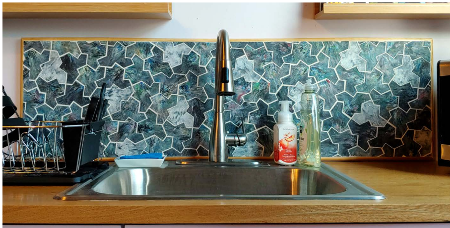
Figure 1: A functional sink backsplash made with “hat” tiles. Each tile is injection molded from recycled post-consumer plastic.

When physically laying a tiled surface - such as a floor, wall, or counter top - with familiar tile shapes and patterns, there are well-established and documented solutions to address common assembly challenges. However, these traditional methods break-down when applied to aperiodic monotiles (such as the “hat” and “spectre” tiles) [5] [6], thus presenting three unique challenges in the context of physically laid tiled surfaces - non-uniform grout spacing, unintuitive patterning, and difficulties in tile manufacturing. An example of each of these challenges with suggested solutions is presented using a sample tiling of a hat polykite with an edge-length ratio of 1:\sqrt{3} (Figure 1).