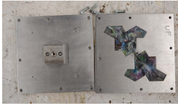
Figure 5: The mold used to produce injection molded hat tiles from recycled plastic.

A simple mold can be used to produce hat-esque tiles quickly and with practically no waste. In the case of the backsplash shown in Figure 1, recycled plastics (chiefly polypropylene) were molded into the mold shown in Figure 5 using a Morgan-Press G-100T model injection molding machine. Further detail of this process is documented at [2]. A similar method could be used with a number of other materials. A critical advantage of injection molded recycled plastics is that they can be made relatively quickly and that both sides of the tile are usable (to simplify the manufacture of mirrored hats).