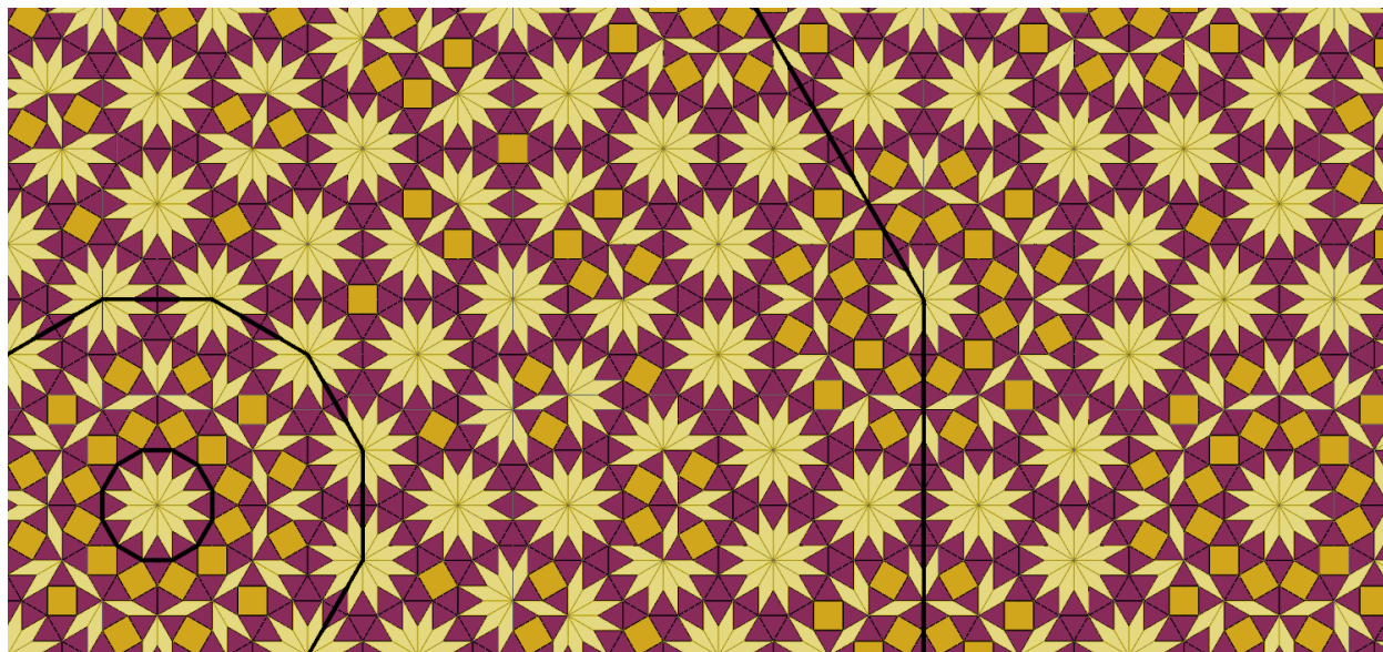
Figure 2: Tiling obtained from the substitutions at the left of Figure 1 with inflation factor of 2 + \sqrt{3} . The center of 12-fold rotational symmetry lies at the lower left. Black lines show the borders of inflation and substitution steps. Initially, there is only a rosette of 12 rhombi and triangles.