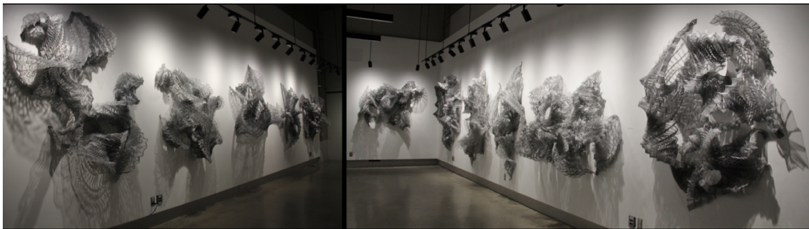
Figure 1: © M. Báez, Diluvio: Teatro delle Ombre, interactive shadow-projections and sculptures.

Expanding upon Leonardo's reflections on perception and nature's inter-connections, the experiential working process and material properties incorporated into Diluvio build upon previous research from the Crossings Interdisciplinary Research Collective [1,2,3]. Previous work explored the morphological, integrative and generative potential of fundamental processes lurking within the diverse realm of natural phenomena. Through the emergent properties of woven and/or folded flexible membranes that perform as highly integrated tessellations, a variety of forms, structures and installations were conceived. The inherent properties of the cellular units and their increased combinations, along with the nature of the materials and processes involved, allowed for haptic and intuitive learning processes to occur.