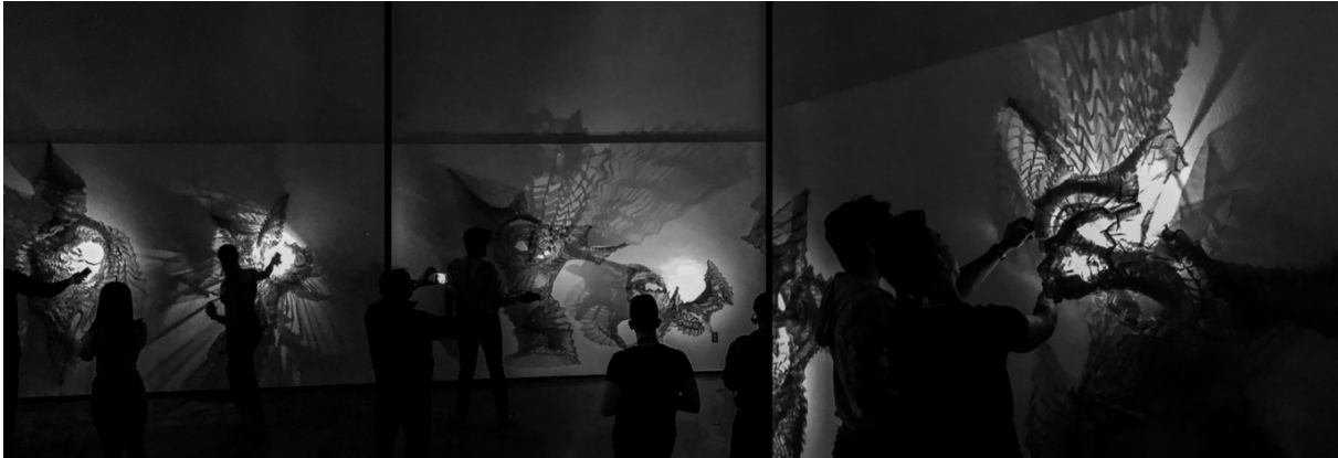
Figure 3: © M. Báez, Diluvio: Teatro delle Ombre , interactive shadow-projections and sculptures.

and improvisations through the much higher degree of overall shape-shifting deformability. Subsequently, this included exploring the shadow projections offered by the variety of possible sculptural configurations, leading to Diluvio: Teatro delle Ombre . Throughout this process, inspiration was drawn from Leonardo's speculations and studies of natural phenomena, with the Miura-ori pattern playing a critical part through related self-folding and organizing patterns found in leaves, petals, insect wings and elsewhere in nature [5]. Leonardo's studies of the properties of water and related phenomena, including, most notably, his evocative Deluge drawings [6], were the main sources for the conceived sculptural installations.