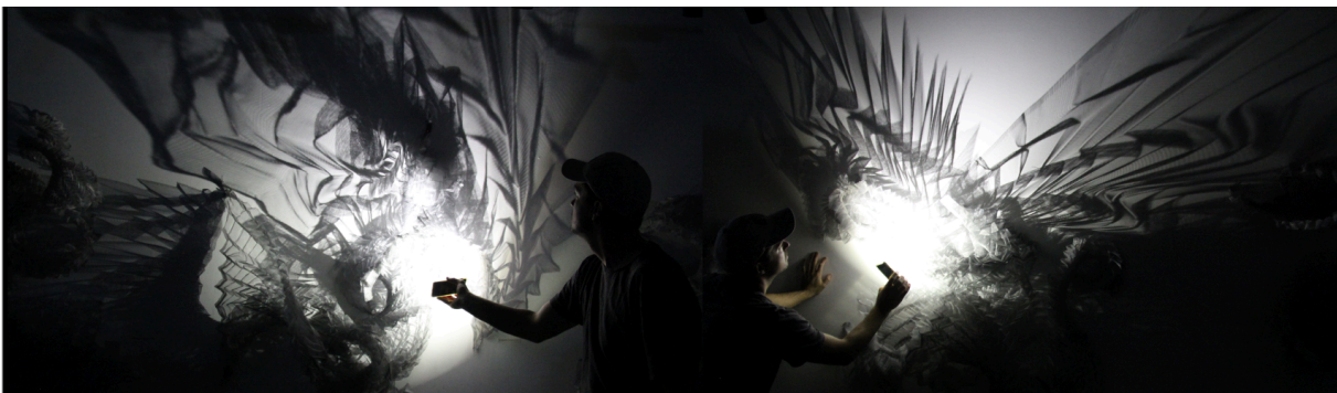
Figure 4: © M. Báez, Diluvio: Teatro delle Ombre , interactive shadow-projections and sculpture details.