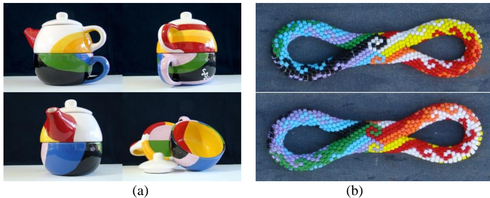
Figure 1: Artworks featuring double torus maps: (a) Tea for Eight , 2010, (b) Eight-Color 8 , 2014.

In 1890, P.J. Heawood proved that eight colors are sufficient to color any map on a double torus and ensure that countries with a common border have different colors [3]. To establish the need for eight colors, it suffices to construct a double-torus map with eight countries, each of which touches all of the others. Various mathematicians and artists have taken up the challenge [2,3,4]; Figure 1 shows two of my artworks on this theme, the painted tea set Tea for Eight , and the bead crochet pendant Eight-Color 8 .