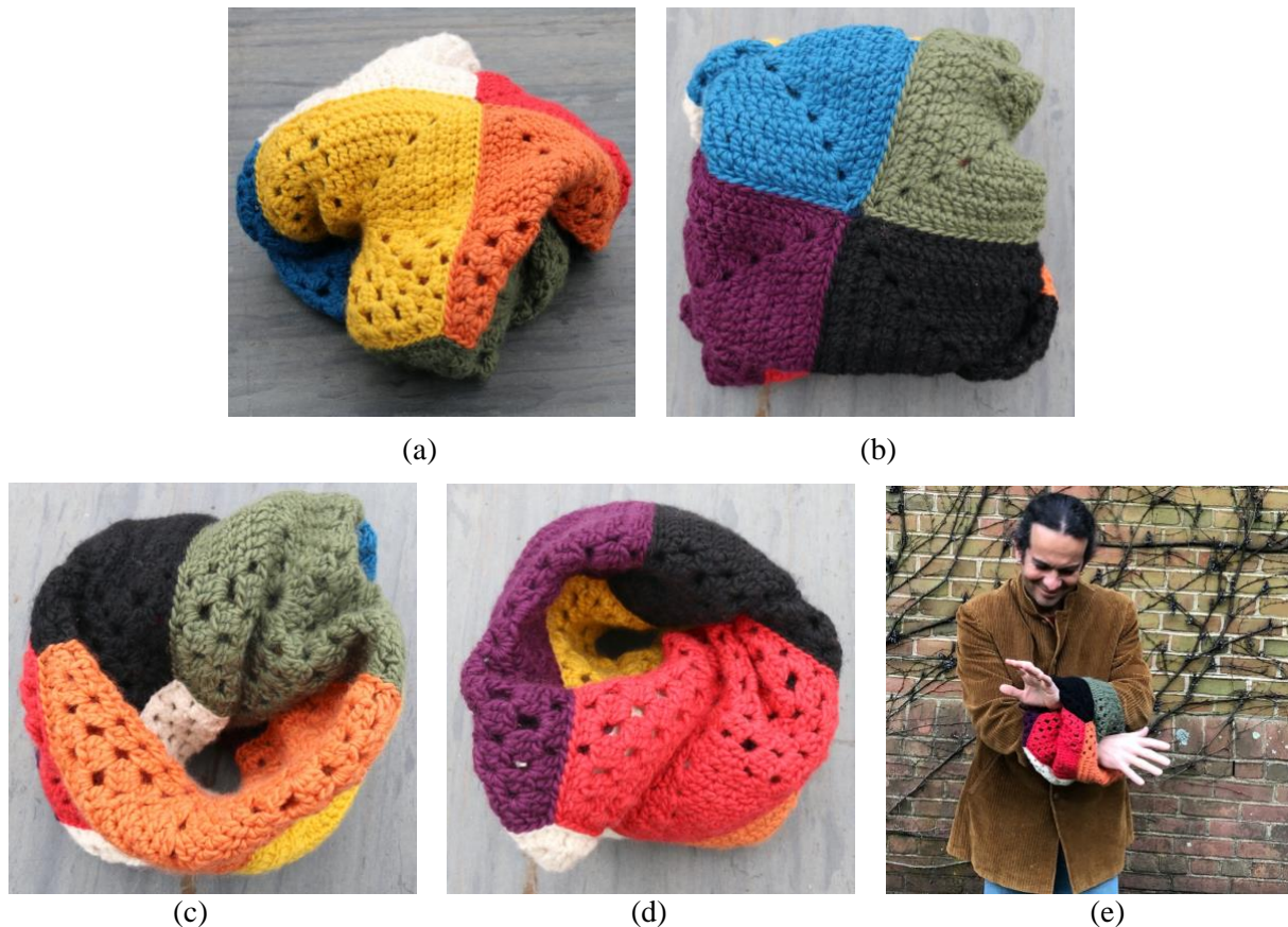
Figure 5: Granny's Double Torus: (a) one vertex of degree 4, (b) the other vertex of degree 4, (c) the hole on the right of the first photo (front side), (d) the hole on the left of the first photo (back side), (e) a topologist studies the properties of Granny's Double Torus.