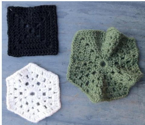
Figure 4: Each heptagon (right) is a combination of a granny hexagon (lower left) and one quarter of a solid granny square (upper left). The resulting polygon has the six 120^\circ angles of the hexagon and the one 90^\circ angle of the quarter-square; the square corner of the green heptagon is in the upper left.

Each of the heptagons in Figure 2 has one vertex that meets three other heptagons, while its remaining vertices meet two other heptagons. This suggests that the optimal crochet interpretation of the heptagon will have one right angle and six 120^\circ angles. To obtain this, I grafted together the patterns for a granny hexagon and a solid granny square into the motif shown on the right of Figure 4. The interior angle sum being less than 900^\circ , the resulting granny heptagon is negatively curved and will not lie flat. It is somewhat reminiscent of the purely hyperbolic granny polygons that Joshua Holden and Lana Holmes Holden developed [5], although their motifs have uniform negative curvature and incorporate much more sophisticated geometry.