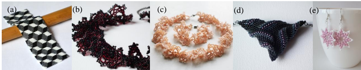
Figure 2: Examples of designs of handmade jewels based on geometric principals: (a) tessellations, (b), (c) fractals, (d) rotational symmetry, and (e) reflection.