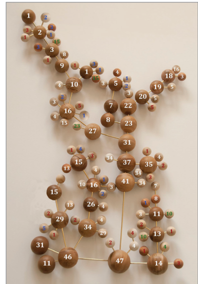
Figure 1: 3-D Tree Dependency Graph for the proof of the Pythagorean Theorem, 1.47, Euclid, Book 1. Proposition 47 is at bottom, center. Key: White – Propositions; Red – Common Notions; Blue – Postulates; Green – Definitions [2].

All edges (connections) in our 3-D graphs direct towards the root of the tree because that root is dependent upon all the premises (vertices, nodes) for its proof. These graphs are unique because there is a proof for every proposition needed to prove any other proposition, should it appear as a premise. However, if a proposition appears more than once, we cite it but do not prove it again.