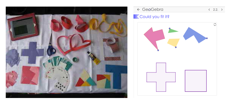
Figure 1: Mathematricks stuffs and related puzzle available in GeoGebra online platform https://www.geogebra.org/m/xpRFvBAQ#material/wVHUUjhh

Playing and learning are natural parts of children's everyday lives. From a child's perspective, these activities are not always separate [3]. The Bridges Conference offers a good opportunity for the public audience in Family Day to reinforce that learning can be strongly connected with playing. Two years ago in Finland we were happy to share a workshop with different materials that we called Mathematricks: Surprising and Revealing . Most of the materials were hands-on activities to physically explore, but some of them were also recreated in its digital format using GeoGebra, as shown in Figure 1. This offered an alternative perspectives and approaches with technology. A welcome surprise was that about one-year later, one of these digital tasks achieved more than twenty thousand views on GeoGebra Materials<sup>1</sup> platform.