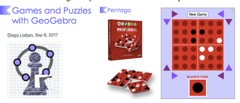
Figure 2: Book on GeoGebra Platform with one of its adaptions available in https://www.geogebra.org/m/xpRFvBAQ

This sizable number of views offered us a clue that puzzles and logical games can attract many users and students and can be used as motivation for activities connected to STEAM ( Science, Technology, Engineering, Art , and Mathematics ) subjects. More merely than playing some already known games and puzzles, students can be encouraged to create and develop their own. They can also go further by improving already existing games based on their interests and designs. Geometric learning benefits were triggered by this approach, and we identified good opportunities to enhance not only mathematical, but also programming skills. Based on this assumption we have created a virtual book in GeoGebra Materials in which a wide ranging collection of such games can be found. This virtual book is intended to inspire other users – especially teachers and students – who can use them for their educational aims. The range of samples offers a diversity of game designs, varying from those that use basic commands such as dragging to others that require more elaborated logical syntax. One of these examples can be seen in Figure 2.