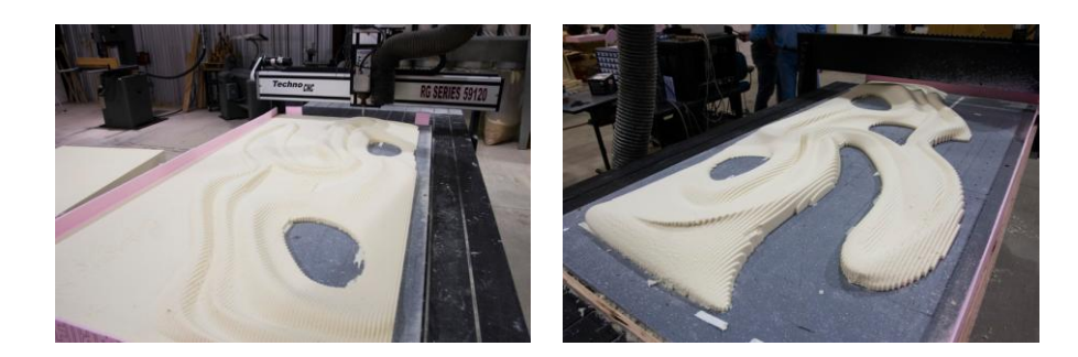
Figure 3 . Photographs showing the first, second step-down of the rough cut, a detail of the rough-cut and the finish-cut The complete installation required a total of 8sheets of 2 lb. foam and 2 sheets of 10 point foam were employed depending on structural requirements inherent to each segment, see figure 2.