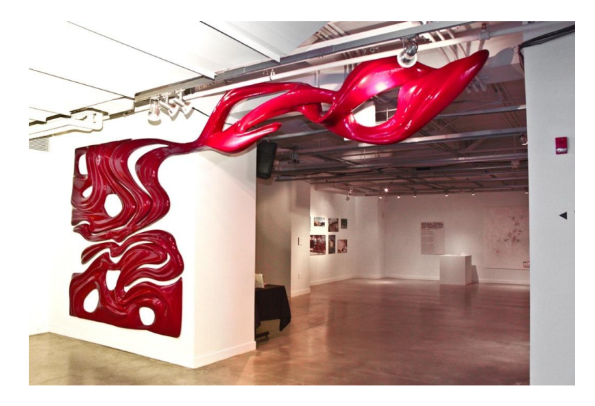
Figure 4. Final piece as installed

Once each piece was milled, we sanded them to smooth out any irregularities, adding three coats of drywall compound after each sanding pass. Since the entire length of the branch was over 8 feet long, we decided to join all of the pieces into two separate branches rather than one large one to allow for easier transportation, and installation. Because this sculptural piece would be suspended over an opening by wires, the connections needed to be very strong so that the branch would not break at the weak joints. For the weaker joints, especially those where the 10 pcf density foam had to be joined to the 2 pcf density foam, we used metal dowel rods to hold the pieces together. At this point we prepared the piece for paint by using two coats of an oil based primer. A professional automotive paint shop did the painting of the wall panels and branch structure completing the assembly. This was the final finishing technique used and was successful in giving the foam the glossy effect as seen in the close-up of the surface in Figure 4.