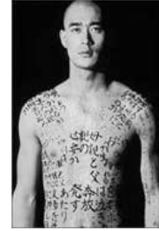
Figure 2: Some scenes from 'The Pillow Book' by Peter Greenaway, 1996.