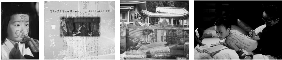
Figure 1: Some scene from “The Pillow Book” by Peter Greenaway, 1996.

In the works of British director Peter Greenaway, whose film is to be examined here, the marks of the painting art and history, particularly of Renaissance painting, thought and painters are easily discernable. Having been treated with the logic of a collage or puzzle, it can be observed in his movies that every sequence was planned like a painting and scenes were constructed as if by an architect. What’s more, his films, in which he features frame compositions that feature multiple images simultaneously, his intense imagery, his use of music/ painting/ graphic elements, poetic intensity of his images, intellectual demonstrations, may be deemed as a sort of adaptation of performance art into films.