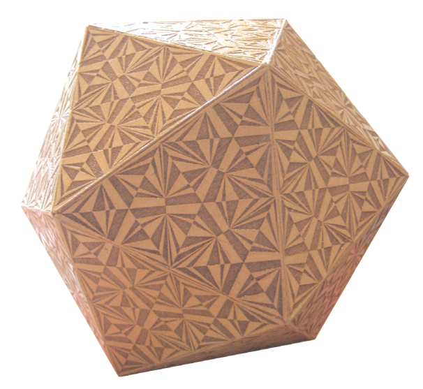
Figure 4 The icosahedron patterned with counterchange pattern class p6m/p6 (created from laseretched wood composite)