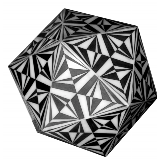
Figure 3 The icosahedron patterned with counterchange pattern class p6m/p6 (created from laseretched and painted acrylic)

Figures 3 and 4 show illustrations of the icosahedron patterned with counterchange class p6m/p6. The model shown in Figure 3 is based on the design previously illustrated in Figure 2, where the area of the pattern that is applied to each face is equivalent to half the unit cell. In Figure 4 an area of patter equivalent to two unit cells is applied to pattern each face. In both instances, all faces are identical.